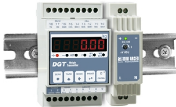
DGT1 with DR1512 optional power supply, for DIN bar