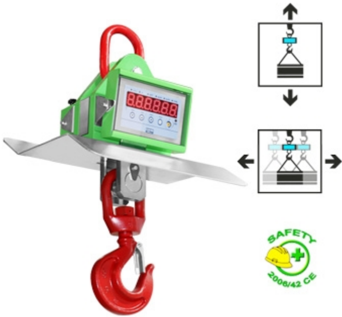
MCWHU with optional ring, swivelling hook and thermal shield