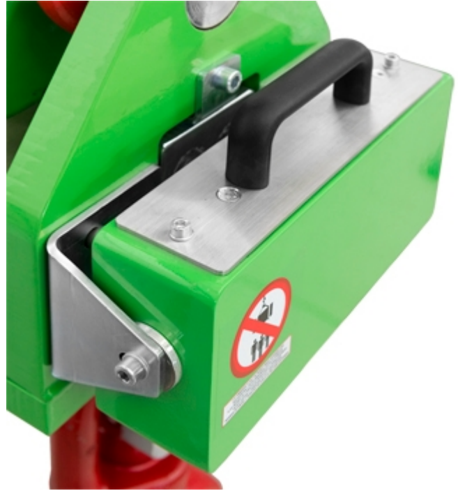
Fitted with extractable rechargeable battery pack.