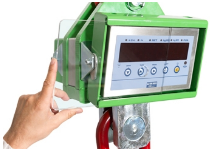
Protective screen in plexiglas for display and keyboard.